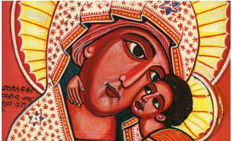
Detail from an Ethiopian Orthodox icon of Mary and the infant Jesus.

NOVEMBER 29, 2015: THE FIRST SUNDAY OF ADVENT